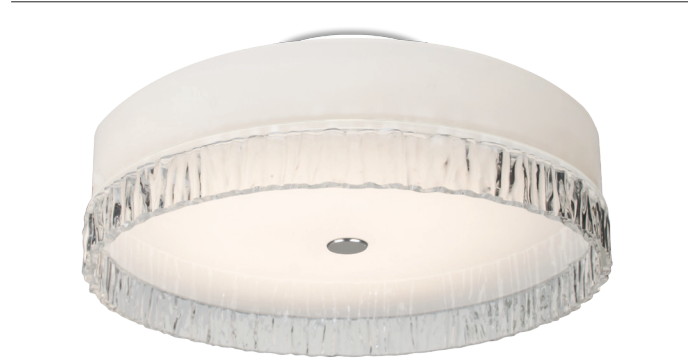
PACO19CLC OPAL/CLEAR STONE