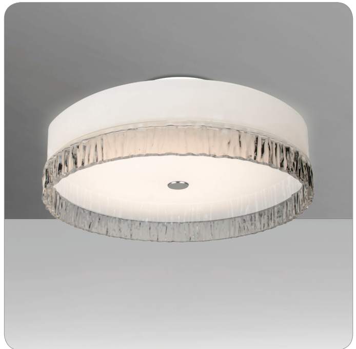
OPAL/SMOKE STONE (PACO19CLC)

UL or ETL Listed. Suitable for Damp Locations (interior use only).