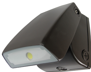
13W &amp; 26W