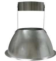
SKFHBA (7) 6762711230 (0)