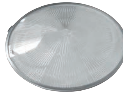
SKFHBCL (7) 6762711232 (4)