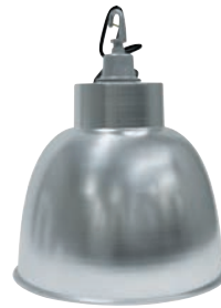
SKFHBSA (7) 6762711414 (4)