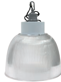
SKFHBP (7) 6762711225 (6)